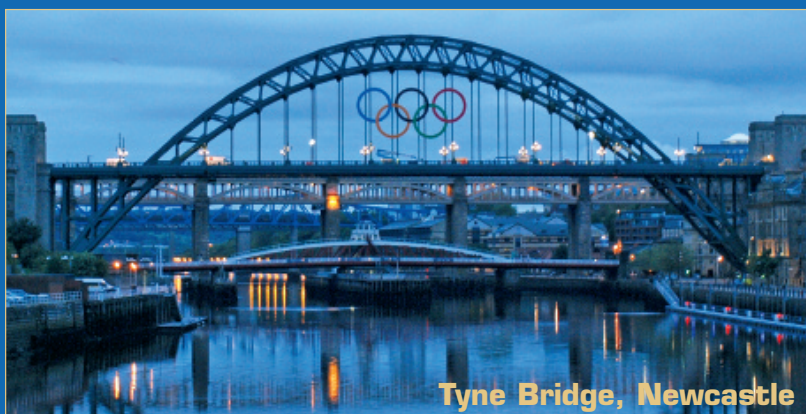
Tyne Bridge, Newcastle

Size doesn't matter for Crown Norge. Our tools can handle the most!